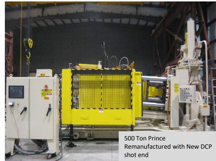
500 Ton Prince Remanufactured with New DCP shot end