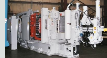
New DCP cold chamber 4-point lockup